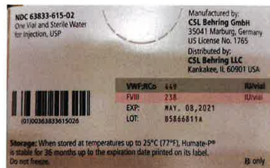
Representative sample of a non-affected lot

Although positioned incorrectly, the printed potency values on the folding box are correct.